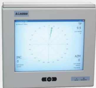
Low-temperature Rig Floor Display