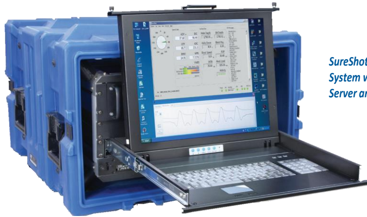
SureShot Ruggedized System with Integrated Server and Terminal